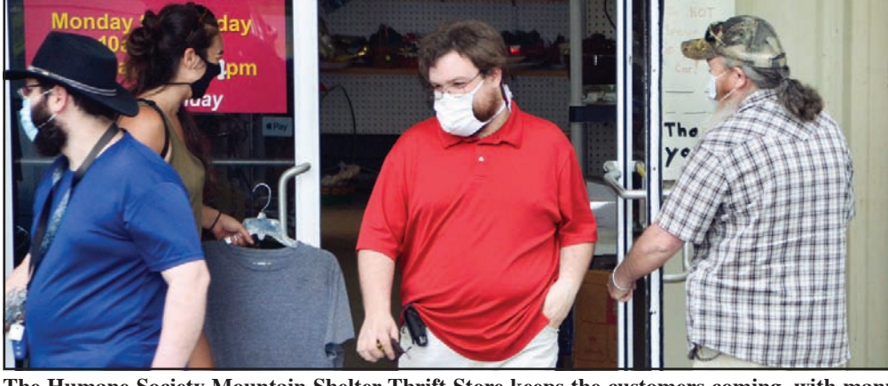
The Humane Society Mountain Shelter Thrift Store keeps the customers coming, with many wearing masks during the pandemic.