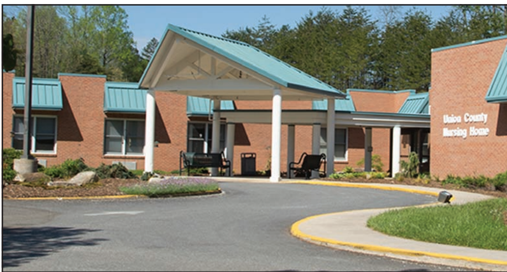
The Department of Public Health announced Friday that 23 long-term care facilities statewide experienced outbreaks from Aug. 6-12. This would include Union County Nursing Home.